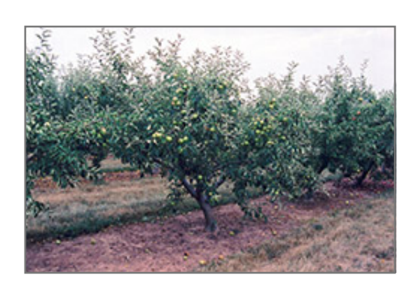
Jonagold Apple

This tree is typically grown in a designated area of the yard because of its mature size and spread. It should only be grown in full sunlight. It prefers to grow in average to moist conditions, and shouldn't be allowed to dry out. It is not particular as to soil type or pH. It is highly tolerant of urban pollution and will even thrive in inner city environments. This particular variety is an interspecific hybrid.