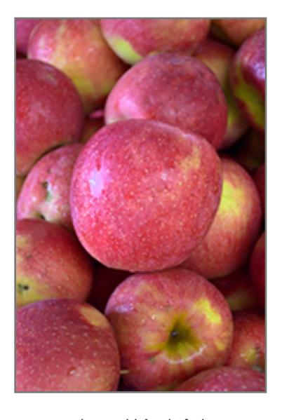
Jonagold Apple fruit

Jonagold Apple features showy clusters of lightly-scented white flowers with shell pink overtones along the branches in mid spring, which emerge from distinctive pink flower buds. It has forest green deciduous foliage. The pointy leaves turn yellow in fall. The fruits are showy yellow apples with a scarlet blush, which are carried in abundance in mid fall. The fruit can be messy if allowed to drop on the lawn or walkways, and may require occasional clean-up.