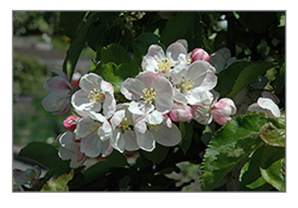
Jonagold Apple flowers