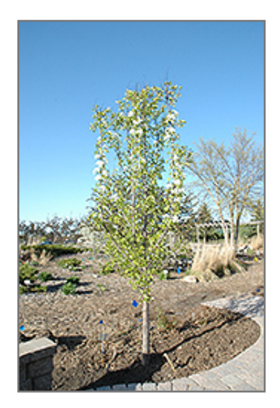
Summercrisp Pear in bloom