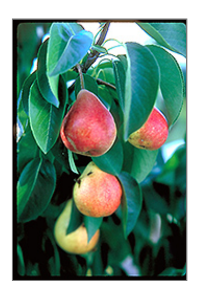
Summercrisp Pear fruit

Summercrisp Pear is clothed in stunning clusters of white flowers with purple anthers along the branches in mid spring. It has dark green deciduous foliage. The glossy oval leaves turn an outstanding burgundy in the fall. The fruits are showy chartreuse pears with a red blush, which are carried in abundance in late summer. The fruit can be messy if allowed to drop on the lawn or walkways, and may require occasional clean-up.