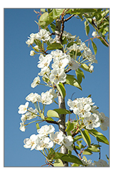
Summercrisp Pear flowers