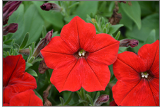
Easy Wave Red Petunia flowers

This plant will require occasional maintenance and upkeep. Trim off the flower heads after they fade and die to encourage more blooms late into the season. It is a good choice for attracting hummingbirds to your yard, but is not particularly attractive to deer who tend to leave it alone in favor of tastier treats. It has no significant negative characteristics.