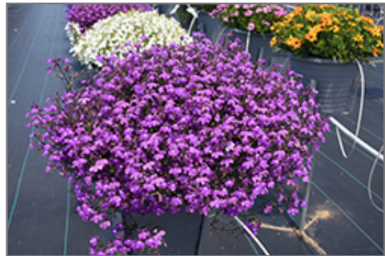
Techno Violet Lobelia in bloom