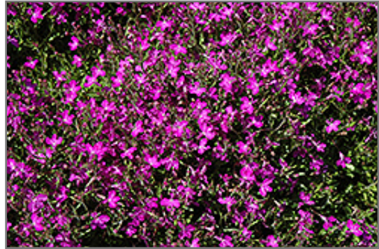
Techno Violet Lobelia flowers

Techno Violet Lobelia will grow to be about 8 inches tall at maturity, with a spread of 12 inches. When grown in masses or used as a bedding plant, individual plants should be spaced approximately 10 inches apart. Its foliage tends to remain low and dense right to the ground. Although it's not a true annual, this fast-growing plant can be expected to behave as an annual in our climate if left outdoors over the winter, usually needing replacement the following year. As such, gardeners should take into consideration that it will perform differently than it would in its native habitat.