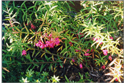
Dwarf Turkestan Burning Bush flowers

This shrub performs well in both full sun and full shade. It is very adaptable to both dry and moist locations, and should do just fine under typical garden conditions. It is not particular as to soil type or pH. It is highly tolerant of urban pollution and will even thrive in inner city environments. This is a selected variety of a species not originally from North America.