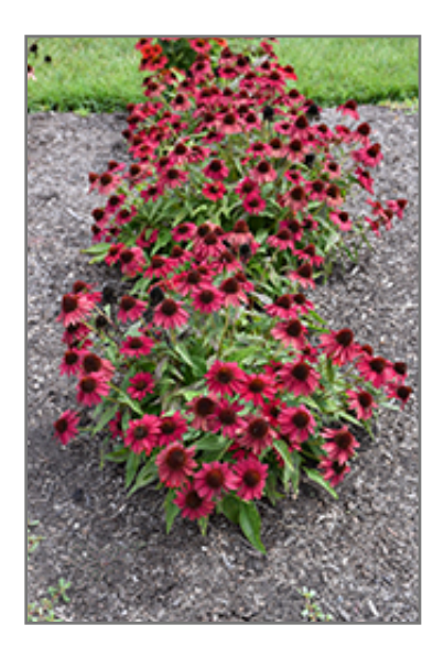
Sombrero Baja Burgundy Coneflower in bloom