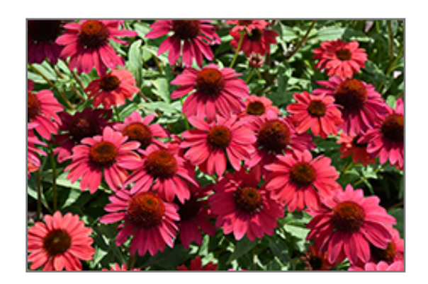
Sombrero Baja Burgundy Coneflower flowers