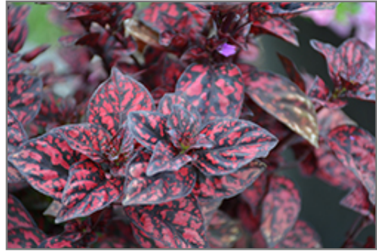
Hippo Red Polka Dot Plant foliage

Hippo Red Polka Dot Plant is recommended for the following landscape applications;