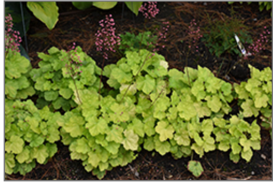
Primo Pretty Pistachio Coral Bells

Primo Pretty Pistachio Coral Bells will grow to be about 10 inches tall at maturity extending to 22 inches tall with the flowers, with a spread of 28 inches. When grown in masses or used as a bedding plant, individual plants should be spaced approximately 26 inches apart. Its foliage tends to remain low and dense right to the ground. It grows at a medium rate, and under ideal conditions can be expected to live for approximately 10 years. As an evergreen perennial, this plant will typically keep its form and foliage year-round.