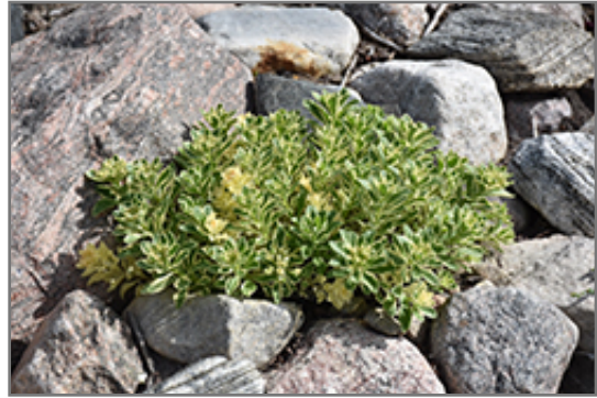
Atlantis Stonecrop