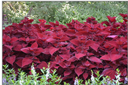
Beale Street Coleus