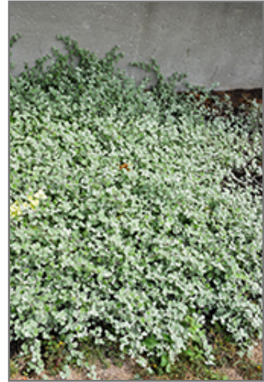
Silver Licorice Plant

Silver Licorice Plant is a fine choice for the garden, but it is also a good selection for planting in outdoor containers and hanging baskets. Because of its trailing habit of growth, it is ideally suited for use as a 'spiller' in the 'spiller-thriller-filler' container combination; plant it near the edges where it can spill gracefully over the pot. Note that when growing plants in outdoor containers and baskets, they may require more frequent waterings than they would in the yard or garden.