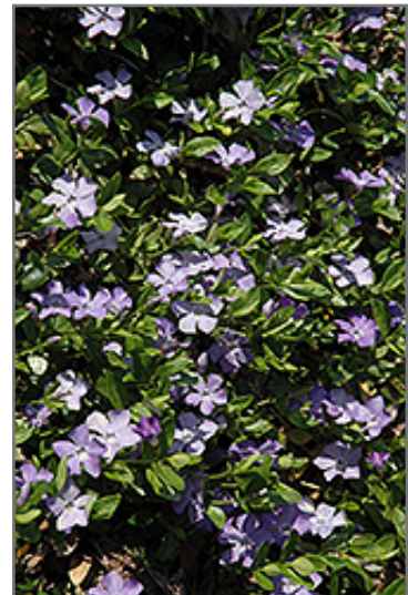
Common Periwinkle in bloom