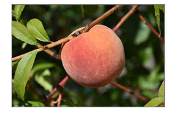
Redhaven Peach fruit

Redhaven Peach is covered in stunning clusters of fragrant pink flowers along the branches in early spring, which emerge from distinctive rose flower buds before the leaves. It has dark green deciduous foliage. The narrow leaves turn yellow in fall. The fruits are showy yellow drupes with a red blush, which are carried in abundance in mid summer. The fruit can be messy if allowed to drop on the lawn or walkways, and may require occasional clean-up.