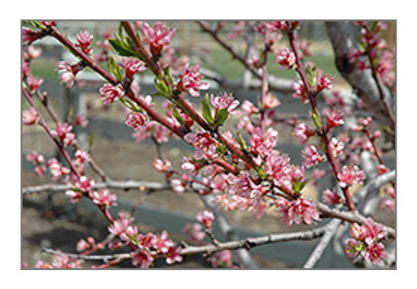
Redhaven Peach flowers