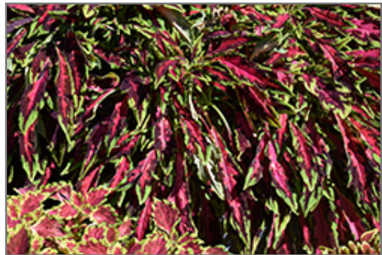
Spitfire Coleus foliage