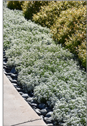
Snow Princess Alyssum in bloom

Snow Princess Alyssum is recommended for the following landscape applications;