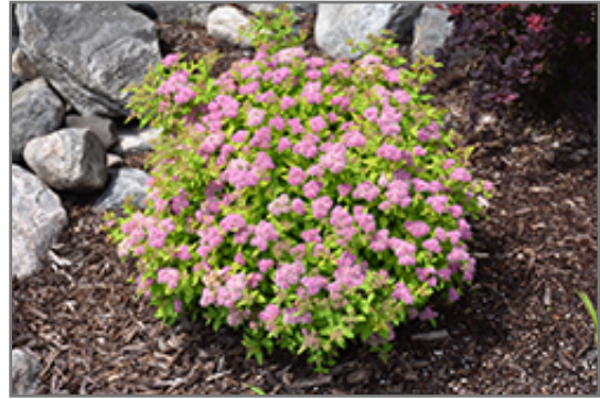
Dakota Goldcharm Spirea in bloom

Dakota Goldcharm Spirea is recommended for the following landscape applications;