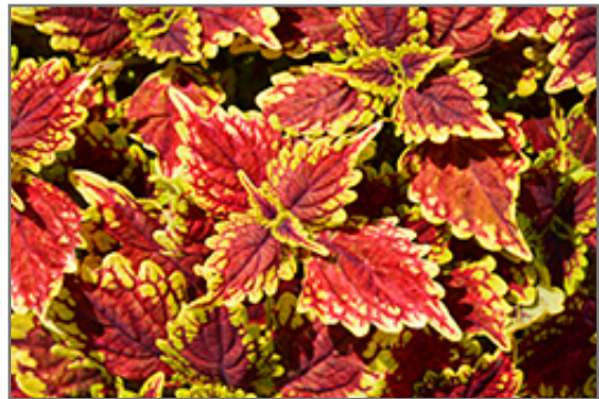
Oxford Street Coleus foliage