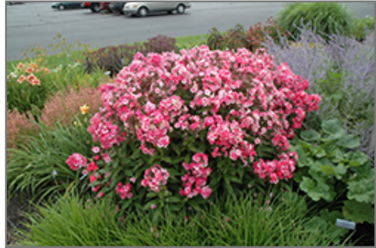
Garden Girls Glamour Girl Garden Phlox in bloom

Garden Girls Glamour Girl Garden Phlox will grow to be about 28 inches tall at maturity, with a spread of 24 inches. When grown in masses or used as a bedding plant, individual plants should be spaced approximately 18 inches apart. It grows at a medium rate, and under ideal conditions can be expected to live for approximately 10 years. As an herbaceous perennial, this plant will usually die back to the crown each winter, and will regrow from the base each spring. Be careful not to disturb the crown in late winter when it may not be readily seen!