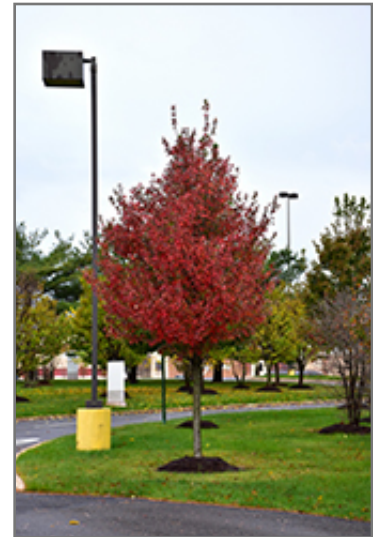
Redpointe Red Maple in fall

This tree should only be grown in full sunlight. It is quite adaptable, preferring to grow in average to wet conditions, and will even tolerate some standing water. It is not particular as to soil type, but has a definite preference for acidic soils, and is subject to chlorosis (yellowing) of the foliage in alkaline soils. It is somewhat tolerant of urban pollution. This is a selection of a native North American species.