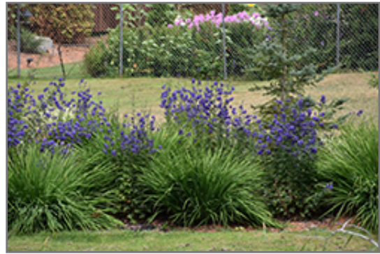
Common Monkshood in bloom

Common Monkshood will grow to be about 3 feet tall at maturity extending to 4 feet tall with the flowers, with a spread of 24 inches. It tends to be leggy, with a typical clearance of 1 foot from the ground, and should be underplanted with lower-growing perennials. The flower stalks can be weak and so it may require staking in exposed sites or excessively rich soils. It grows at a medium rate, and under ideal conditions can be expected to live for approximately 15 years. As an herbaceous perennial, this plant will usually die back to the crown each winter, and will regrow from the base each spring. Be careful not to disturb the crown in late winter when it may not be readily seen!