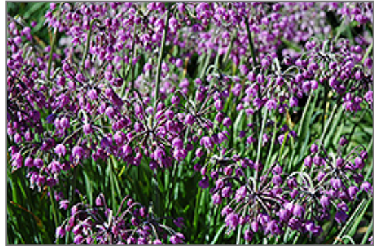
Nodding Onion flowers