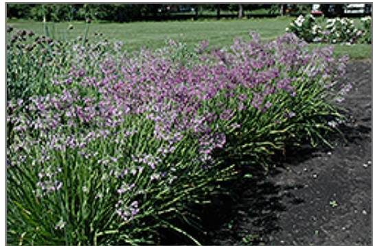
Nodding Onion in bloom