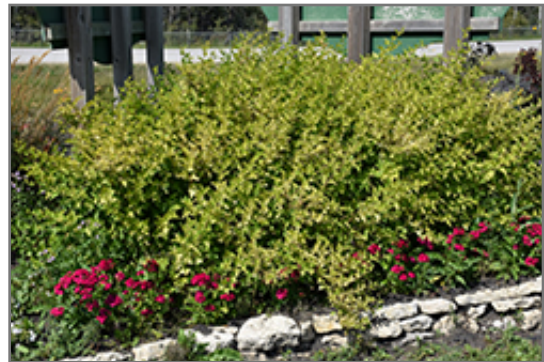
Festivus Gold Ninebark