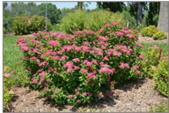
Double Play Red Spirea in bloom