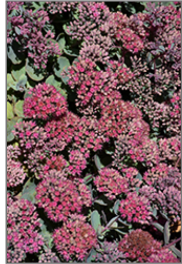
Popstar Stonecrop flowers

Popstar Stonecrop is a fine choice for the garden, but it is also a good selection for planting in outdoor pots and containers. It is often used as a 'filler' in the 'spiller-thriller-filler' container combination, providing a mass of flowers and foliage against which the thriller plants stand out. Note that when growing plants in outdoor containers and baskets, they may require more frequent waterings than they would in the yard or garden.