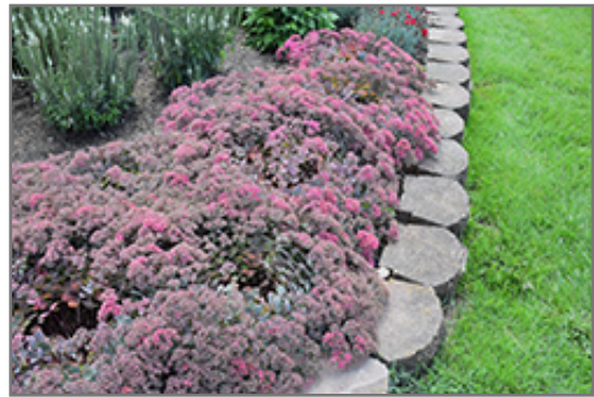
Popstar Stonecrop in bloom