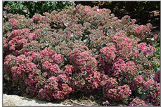
Popstar Stonecrop in bloom