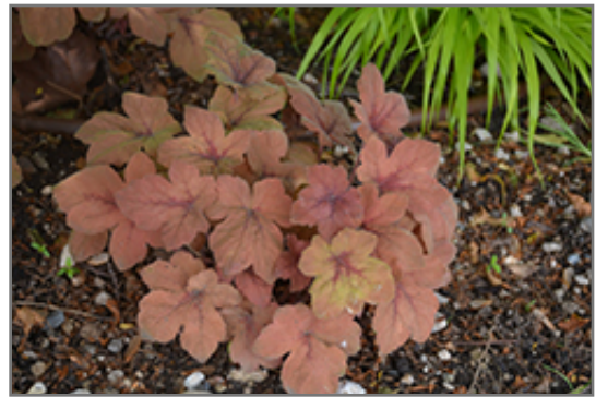
Pumpkin Spice Foamy Bells