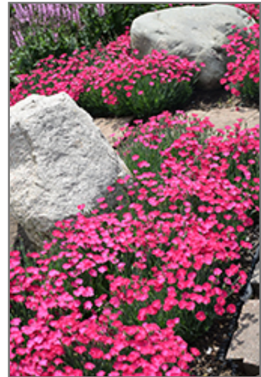
Paint The Town Magenta Pinks in bloom

Paint The Town Magenta Pinks is an herbaceous evergreen perennial with a mounded form. It brings an extremely fine and delicate texture to the garden composition and should be used to full effect.