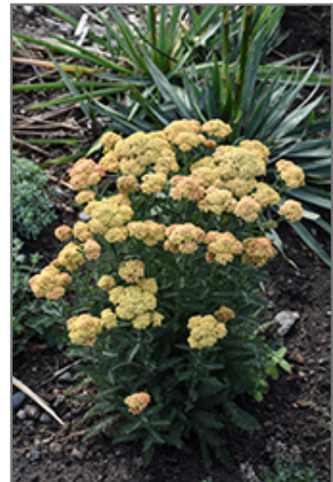
Firefly Peach Sky Yarrow in bloom