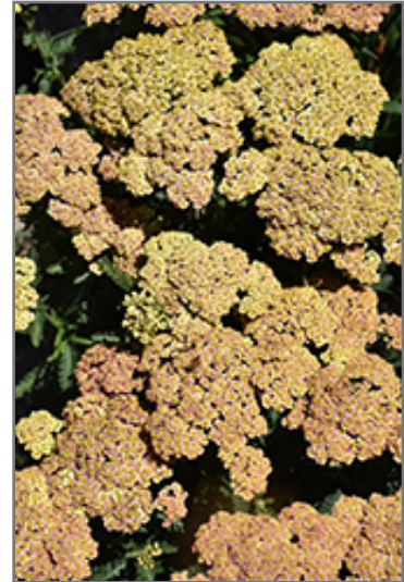
Firefly Peach Sky Yarrow flowers

Firefly Peach Sky Yarrow is recommended for the following landscape applications;