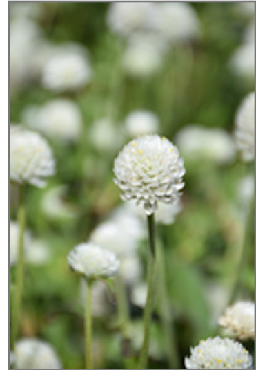
Ping Pong White Globe Amaranth flowers

Ping Pong White Globe Amaranth is recommended for the following landscape applications;