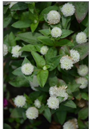
Ping Pong White Globe Amaranth flowers