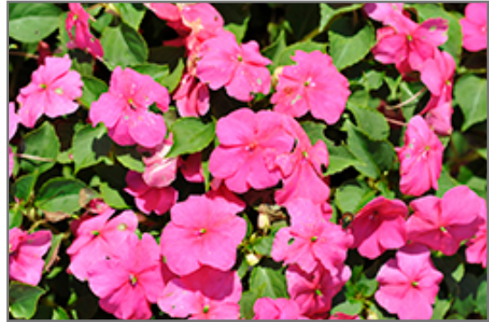
Beacon Rose Impatiens flowers

Beacon Rose Impatiens is recommended for the following landscape applications;