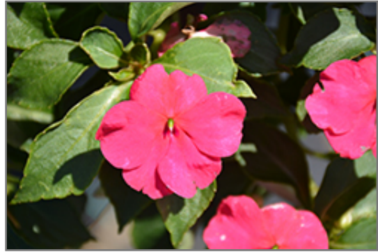
Beacon Rose Impatiens flowers

Beacon Rose Impatiens will grow to be about 15 inches tall at maturity, with a spread of 12 inches. When grown in masses or used as a bedding plant, individual plants should be spaced approximately 8 inches apart. Its foliage tends to remain dense right to the ground, not requiring facer plants in front. This fast-growing annual will normally live for one full growing season, needing replacement the following year.