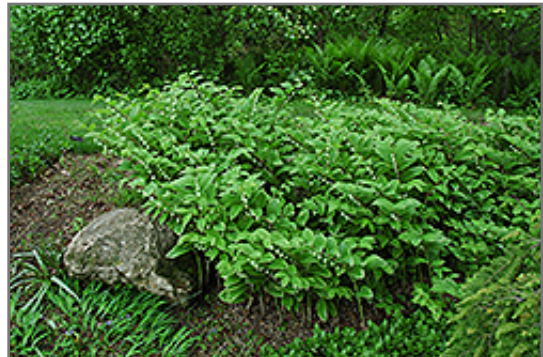
Variegated Solomon's Seal in bloom