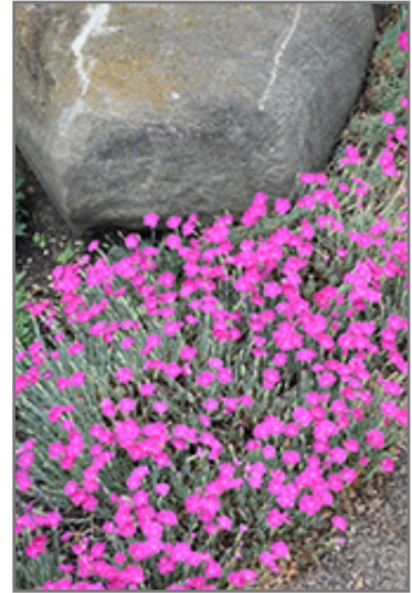
Firewitch Pinks in bloom

Firewitch Pinks is a fine choice for the garden, but it is also a good selection for planting in outdoor pots and containers. It is often used as a 'filler' in the 'spiller-thriller-filler' container combination, providing a mass of flowers and foliage against which the thriller plants stand out. Note that when growing plants in outdoor containers and baskets, they may require more frequent waterings than they would in the yard or garden.